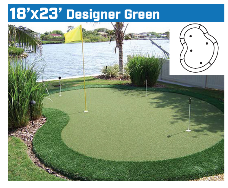
KIT INCLUDES: Ground stabilization fabric, pre-cut UltraBaseSystems Professional panels, putting turf, fringe, cups and pins.