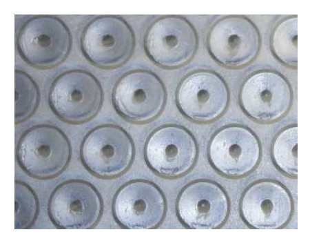
Grip elements on the upper surface of the panel.