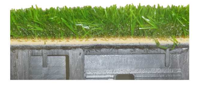
Sectional view of surface panel with overlying felt-backed artificial turf.

The surface of the underlayment panel incorporates spike-like grip elements, ~1 mm in diameter and ~2 mm high and spaced at ~15 mm intervals on a equilateral triangular grid. These elements are intended to penetrate the backing of overlying turf, gripping the turf in a manner that increases the effective friction between the two layers and increases shear resistance.