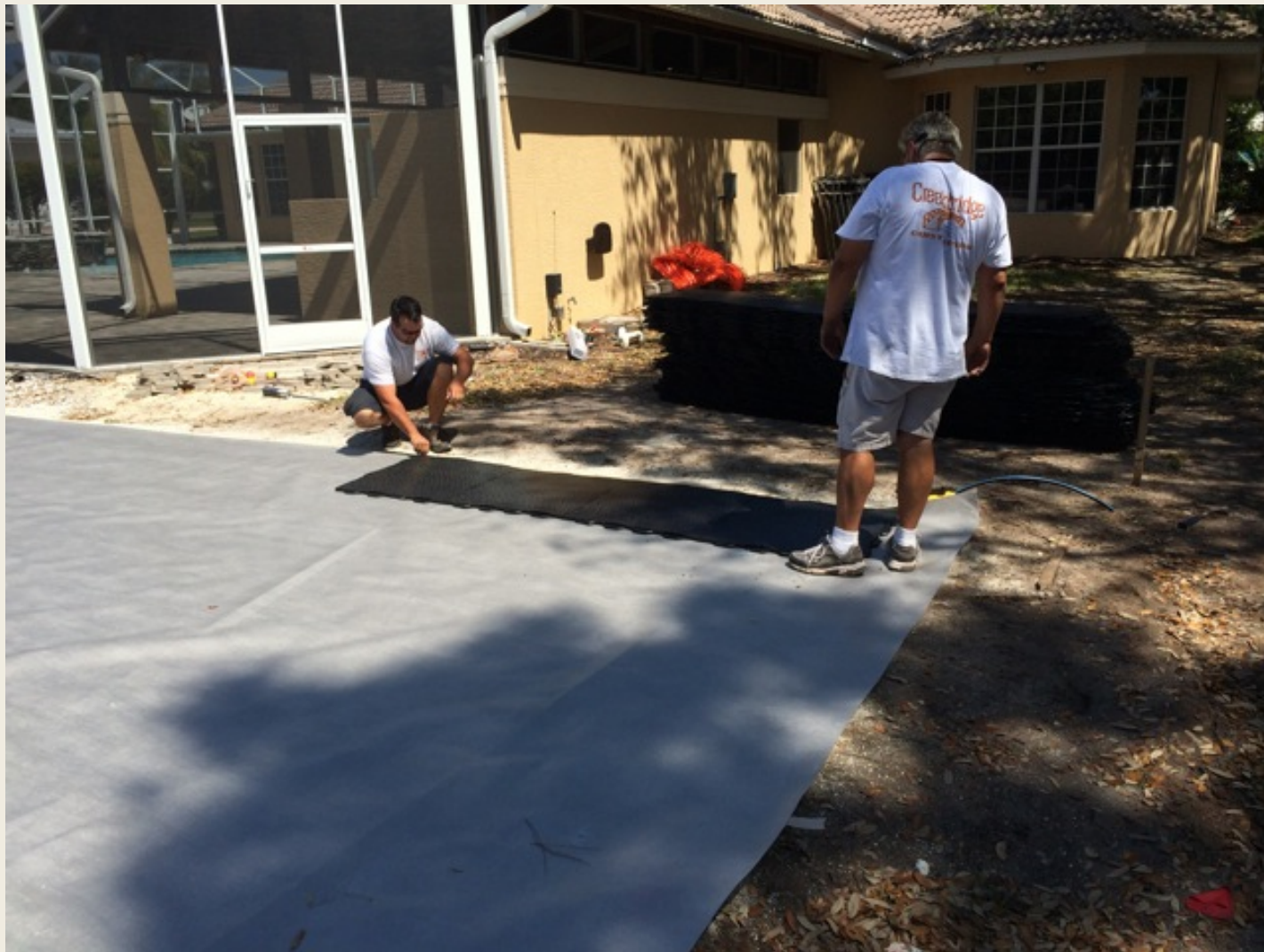
Geo Stabilization Fabric is installed over the sub base and the panel installation begins.